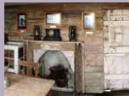
CHART ROOM AND MCBRIDE HUT